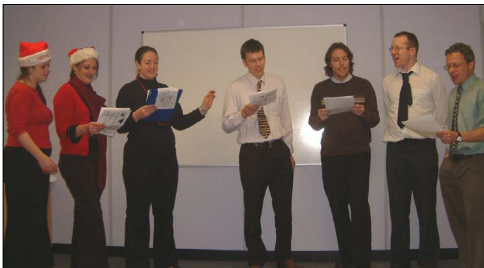
The ELC Teachers – singing!